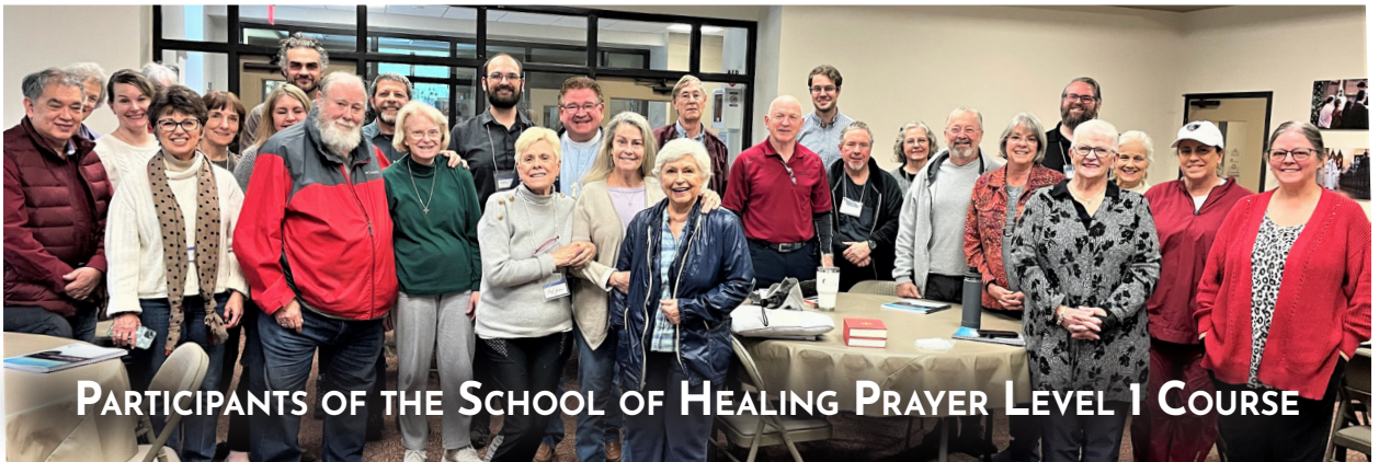
PARTICIPANTS OF THE SCHOOL OF HEALING PRAYER LEVEL 1 COURSE

And please remember that prayer ministers are available to pray with you during communion at each Sunday morning service. Simply come to the south transept after receiving Communion, and our prayer ministers will gladly receive you.