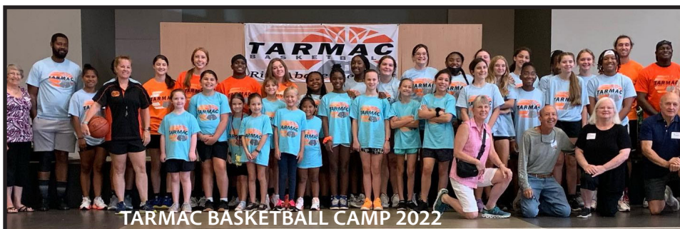
TARMAC BASKETBALL CAMP 2022